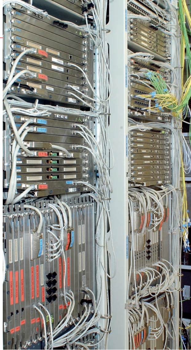
The SI3000 MSAN (Multiservice Access Node) was launched on the market about a year ago, and offers a combina-

segments of new multimedia telecommunications networks, mergers such as Ericsson-Marconi, Alcatel-Lucent, Siemens-Nokia and others went ahead. In the face of these changes Iskratel is carefully mapping out its regional and product strategies in order to ensure its survival and growth. Its strategy is based on the development of products that are explicitly tailored to the needs and possibilities of its customers. The countries of Central and Eastern Europe, which is Iskratel's major market, fall into the category of emerging markets. They endeavor to bridge a telecommunications development gap of several decades with ambitious projects, while having an end-user base with a purchasing power several times smaller than developed countries. Owing to these limitations, Iskratel is developing products based on state-of-the-art technology, but still providing outstanding economy in the initial stages of development. During this stage, a low initial price and the largest possible re-use of the existing digital network is required. Advanced technology, scalability and connectivity to existing networks are features with which we wish to be at the very top of available solutions, thus becoming a specialist for the evolutionary development of emerging networks. The requirements of multimedia networks are met with two products: the SI3000 MSAN and the SI3000 MSCN.